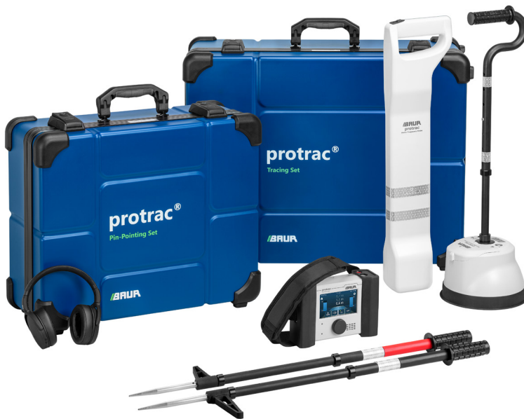
The figure is illustrative.